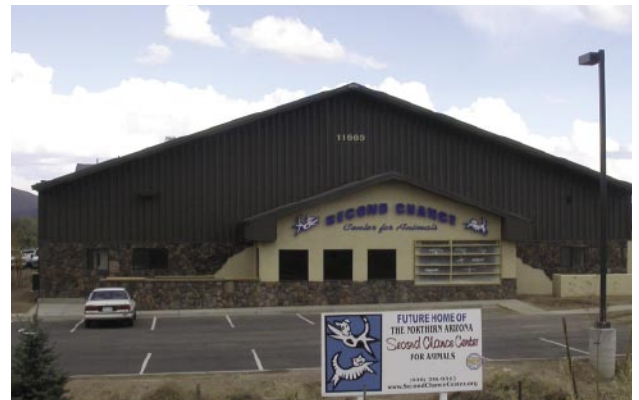
The shelter nears completion in this September 27th photo.

The pre-engineered metal building has been under construction for the past year on a 10-acre campus. The center will include fully outfitted veterinary offices, a spacious education room, outdoor exercise areas, administrative offices, the Plateauland Mobil Veterinary Clinic and a retail store that will carry animal supplies. The center will be one of the “greenest” animal shelters in the country. Rain and snow will be harvested into a 30,000-gallon tank and used for spraying the kennels. Gray water will be stored in a 5,000-gallon tank and used for landscaping. Trees and plants, selected with the help of the Flagstaff Arboretum, are nearly all native, wind-tolerant and low-water users. Second Chance will serve Flagstaff, surrounding towns and Native American reservations in Northern Arizona.