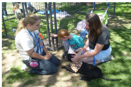
Four legged pal from Second Chance Center for Animals with his new family.

The day was full of festivities, food and music and resulted in several animals finding their forever homes. Demonstrations and low cost vaccinations went on throughout the event and animal organizations from across the southwest including SCCA brought adorable adoptable pets looking for homes. In one day, at one place, 35 shelter animals found their forever family! Thank you to all our sponsors and all the organizations that made this day possible.