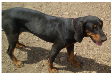
Moon Pie 7/17/08

Adopted! For every animal that finds their forever home, there is another waiting. Please adopt a shelter animal.